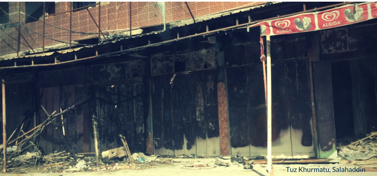
Tuz Khurmatu, Salahaddin