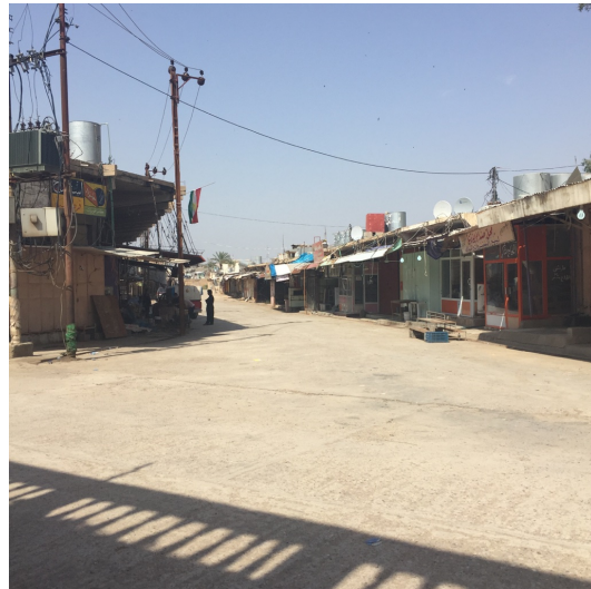
Jalawla Bazaar, April 2016