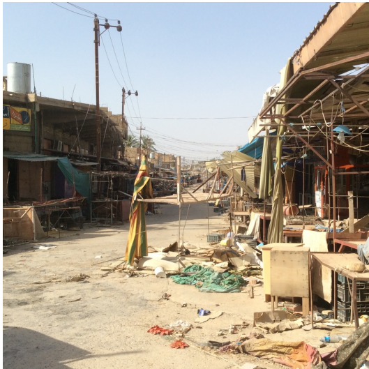
Jalawla Bazaar, May 2015